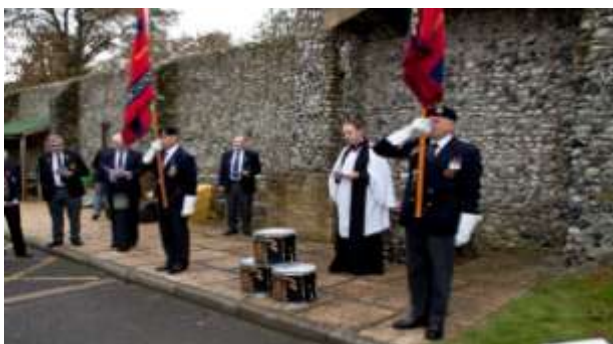
Drum Head Service