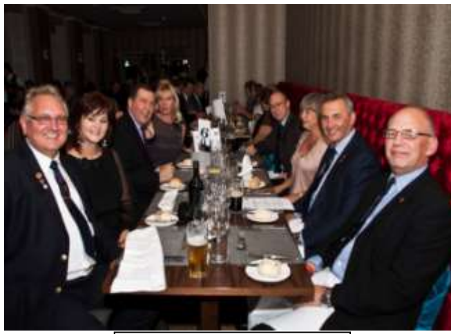
Happy Diners (Table Six)