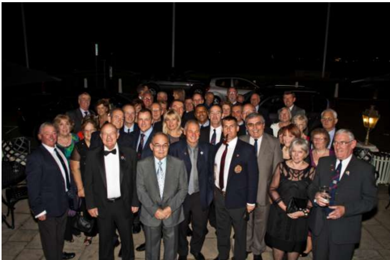
Dinner Guests 2011