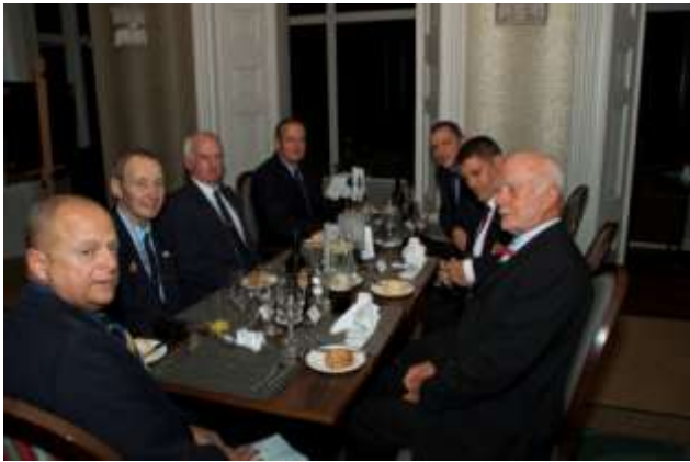
Would you borrow money from these?