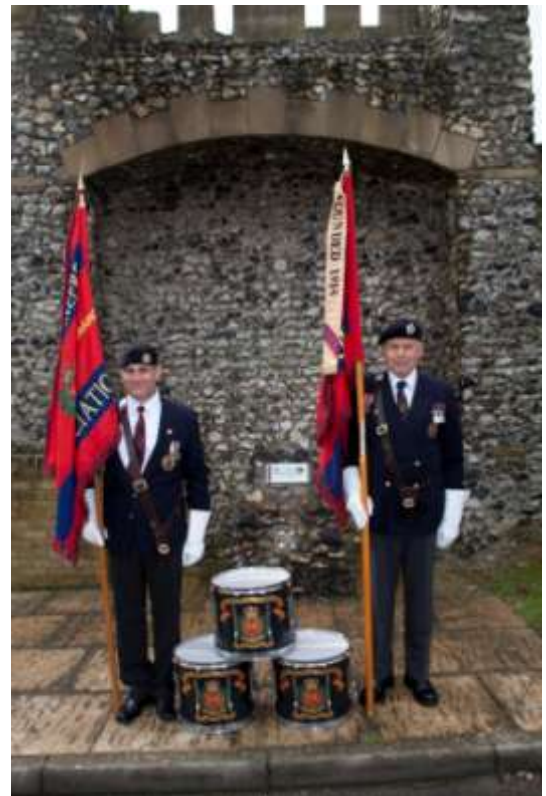
The Dover & J.L. Standards